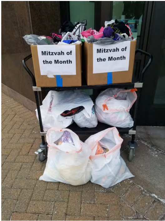
May Mitzvah of the Month involved a collection of the following: warm hats for adults, teens and children, scarves, mittens, and gloves .