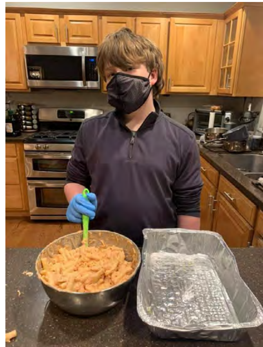
Livingston Neighbors Helping Neighbors (LNHN) picked up the ziti meals from the Temple and delivered them to needy neighbors in Livingston and Newark.