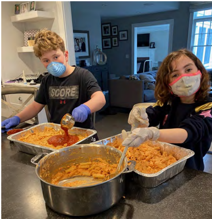
For the June Mitzvah of the Month, the Social Action Committee asked TBA congregant families to contribute a pan of meatless baked ziti to ease the food insecurity faced by our Essex County neighbors.