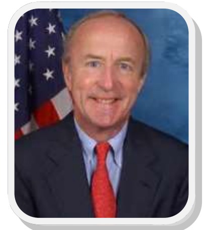
Congressman Rodney Frelinghuysen on Sunday, September 25, 9:30 AM